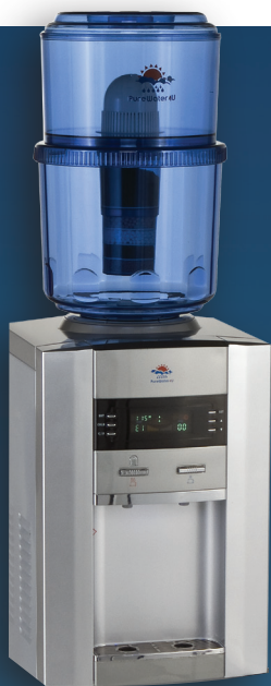
Pure Water Bench Top Cooler