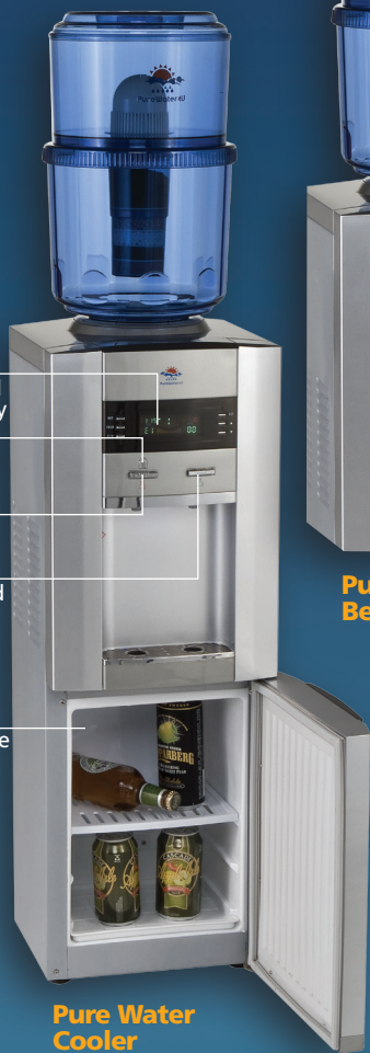
Pure Water Cooler